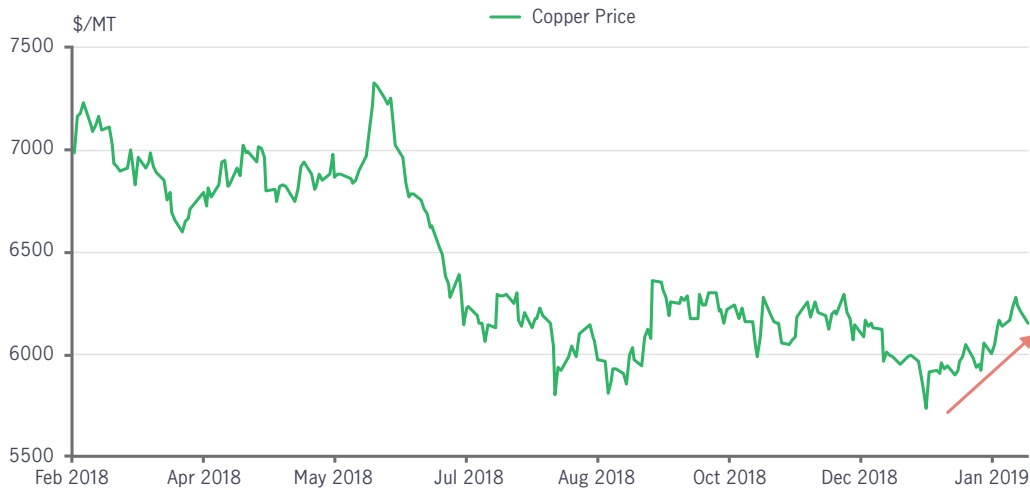
Chart 2: Improving copper prices reflect improving Chinese growth story

As of 12 February 2019