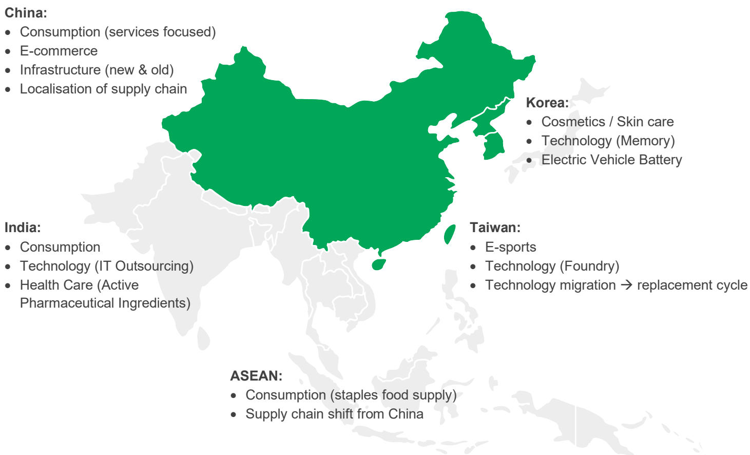
Chart 2: Asia's diverse comparative advantages 6

China: China has adopted a robust policy response in answer to fractious economic relations with the US that will deepen existing competitive advantages.